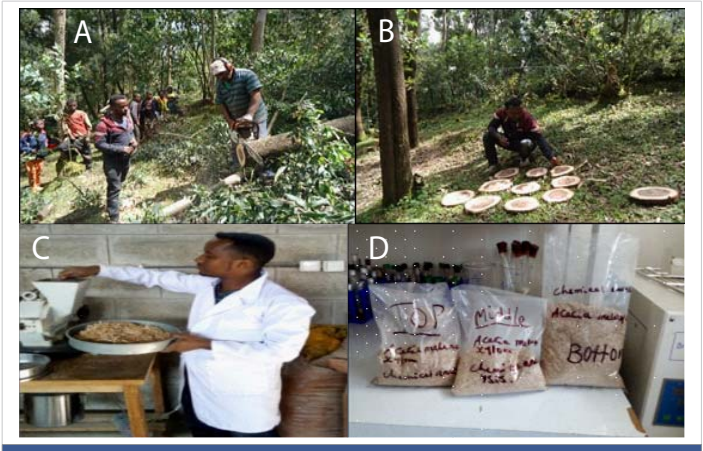
Figure 2: Sample collection and preparation: cutting disks and coding (A&B), Grinding (C&D).

Wood discs 25 mm thick were systematically taken along tree height levels, at the bottom (10%), middle (50%), and top (90%) of tree height (Figure 2A) [11]. Thereafter, the collected disks were cut into small strips with a knife and dried. The strips were small enough to be placed in a grinding machine and chips were ground in the Wiley mill (Figure 2C). Then the milled material was placed in a shaker with sieves to pass through a number 40 mesh sieve (450 \mu m) yet retained on a number 60 mesh sieve (250 \mu m). Finally, each chemical composition analysis was carried out according to American standards for Testing Materials (ASTM).